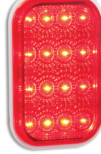
Stop/Tail 131RM - Single Blister