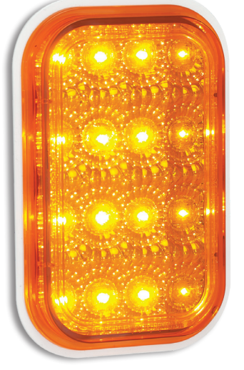
Rear Indicator 131AM - Single Blister